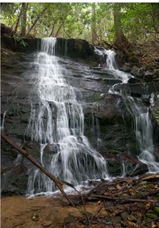
Waterfall on return from White Cliffs overlook

The hike began at the abandoned Old Harper farm dating back to 1840. Once in the forest they encountered several forest types of differing ages, most as older second growth lending the feeling of what the early settlers might have experienced when the area was first settled. They also examined an old homestead. History, ecology, views, exercise, and rest amongst the wild flowers—the hikers got it all!