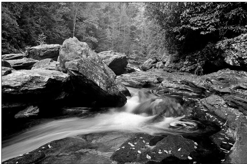
One of the many excellent photographs chosen for the 2009 day planner.

We are also talking to our friends at REI about carrying the day planner during the coming holiday season. So keep your eyes open when you’re shopping for your loved ones at the Atlanta area REI stores. ■